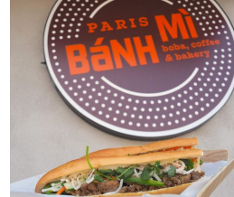
Paris Bahn Mi