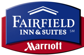
Fairfield Inn & Suites