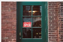
T. Bowman Furniture Traders