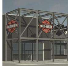
Queen City Harley Davidson