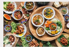
Chao Phraya Thai Cuisine